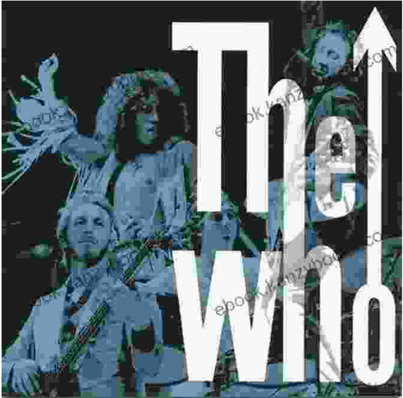
Some of The Who's most famous album covers.