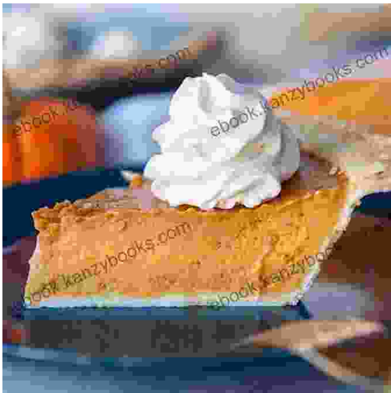
Battenberg Cake: A Checkered Delight

Celebrate the essence of autumn with this timeless classic, Pumpkin Pie. The smooth and silky pumpkin filling, enveloped in a flaky and buttery crust, is a culinary symphony that embodies the flavors of Halloween. Adorned with intricate latticework or festive cutouts, this pie is a centerpiece that will grace any Halloween table.