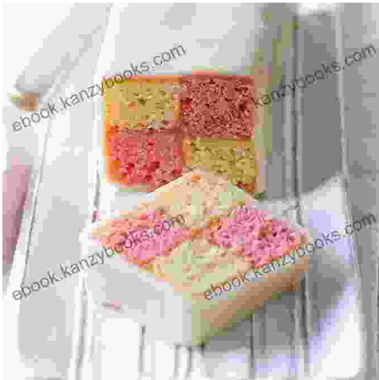
The Magic of Retro Halloween Baking

Unveil the mystery behind the Battenberg Cake, a captivating confection that has graced Halloween celebrations for centuries. With its alternating squares of pink and yellow sponge cake, coated in a delicate marzipan and adorned with intricate patterns, this cake is a visual masterpiece that will mesmerize your guests. The sweet and subtle flavors make it a delightful treat that will transport you back to the Victorian era.